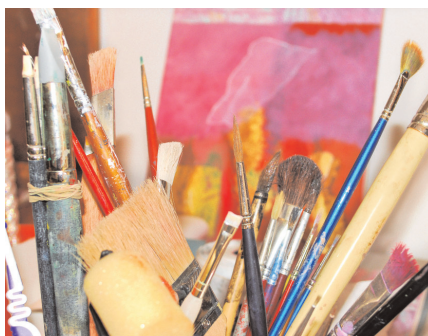
Stroke of genius Ted's collection of brushes

Ted taught art at Hills Road Sixth Form College for more than 30 years and on