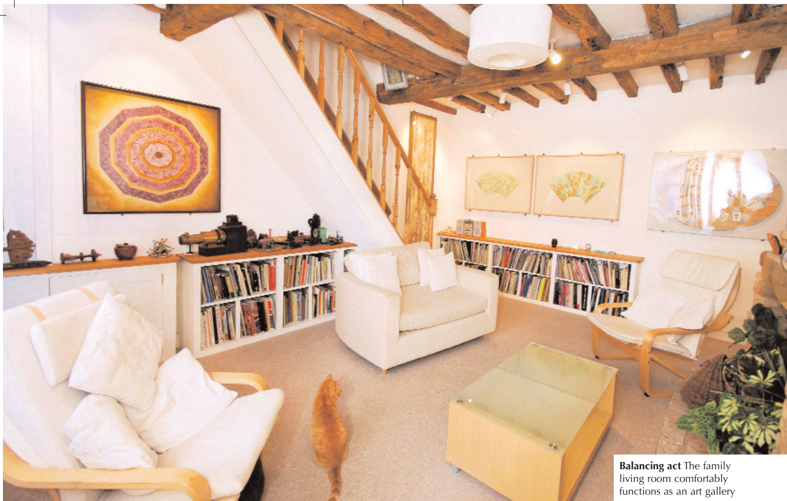
Balancing act The family living room comfortably functions as an art gallery