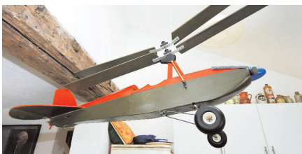
Moveable art The plane hangs in the kitchen